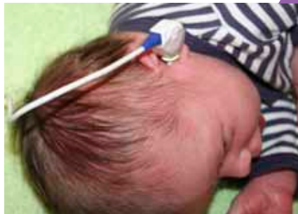
Correct probe placement.